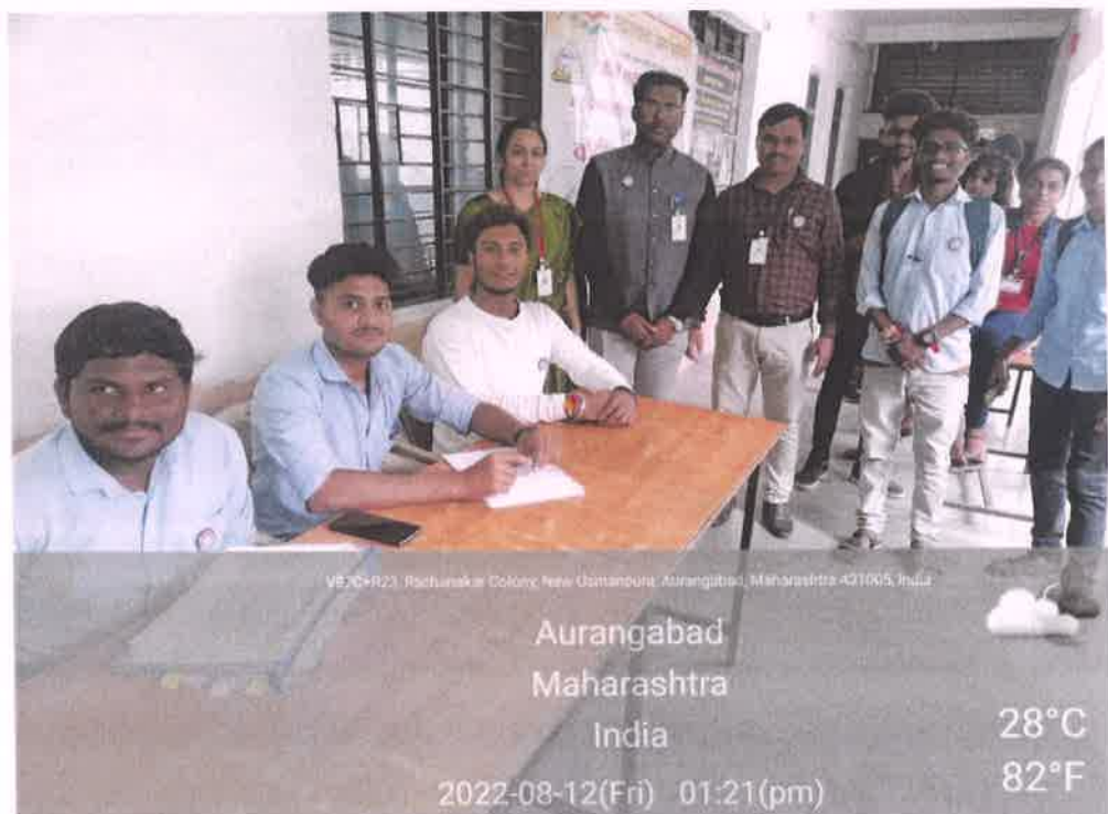
Nss volunteers's participation in Covid-19 vaccination camp at Deogiri college campus on 12/08/2022