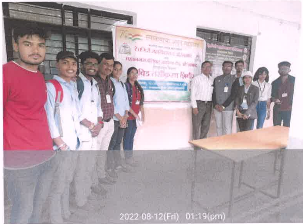
Nss volunteers's participation in Covid-19 vaccination camp at Deogiri college campus on 12/08/2022